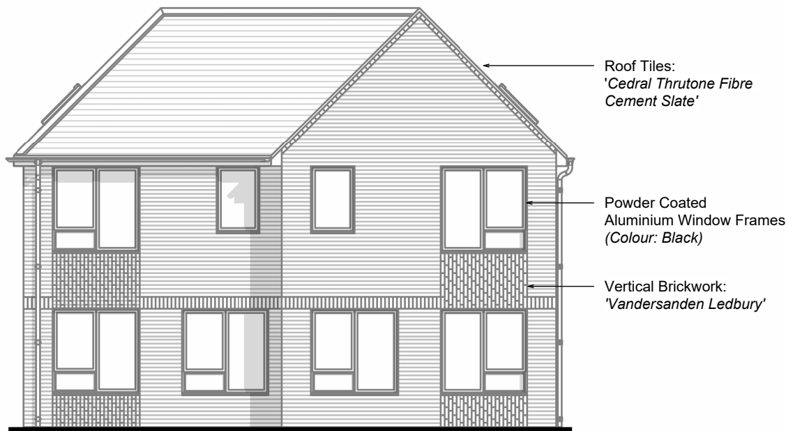
Proposed North Elevation Scale: 1 : 100@A3