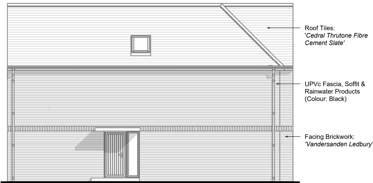
Proposed West Elevation Scale: 1 : 100@A3